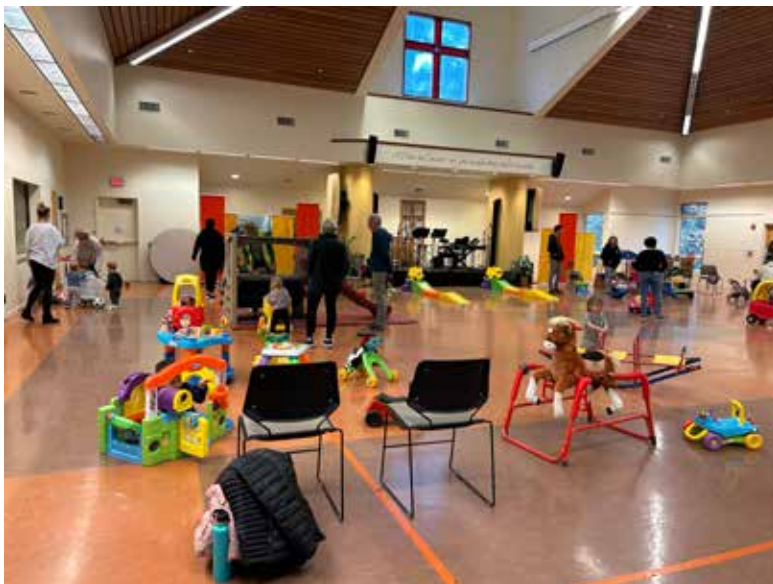
Early in the day at the Play Park!