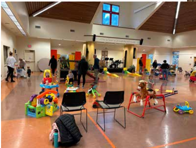
Early in the day at the Play Park!

Many thanks to all who have come out to help. We would be very happy to have you come and join us!