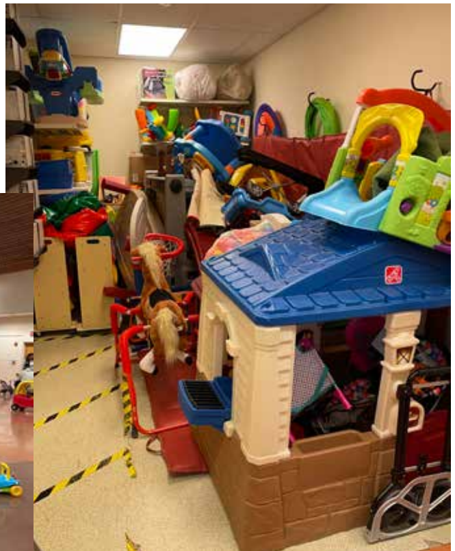
The great puzzle that is the Play Park storage and electrical closet in the Fellowship Hall!